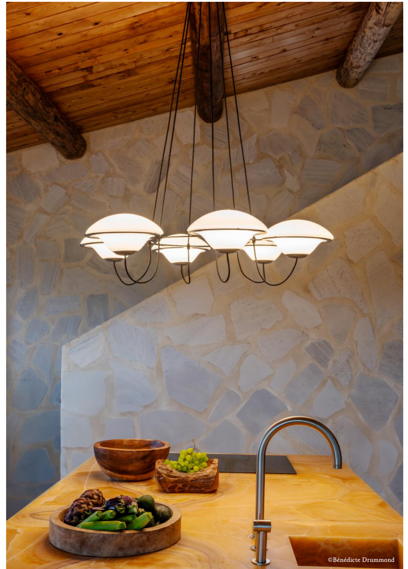
In the Air 6

With its 'UFO-like' lights, the In the Air chandelier fits into a repertoire blending retro-futuristic fantasy and nostalgic science fiction.