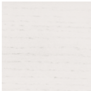
White Stained Oak