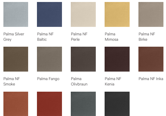
Palma Silver Grey | Palma NF Baltic | Palma NF Perle | Palma Mimosa | Palma NF Birke | Palma NF Smoke | Palma Fango | Palma Olivbraun | Palma NF Kenia | Palma NF Inka | Palma Whisky | Palma Lachs | Palma NF Antrazit | Palma NF Schwartz