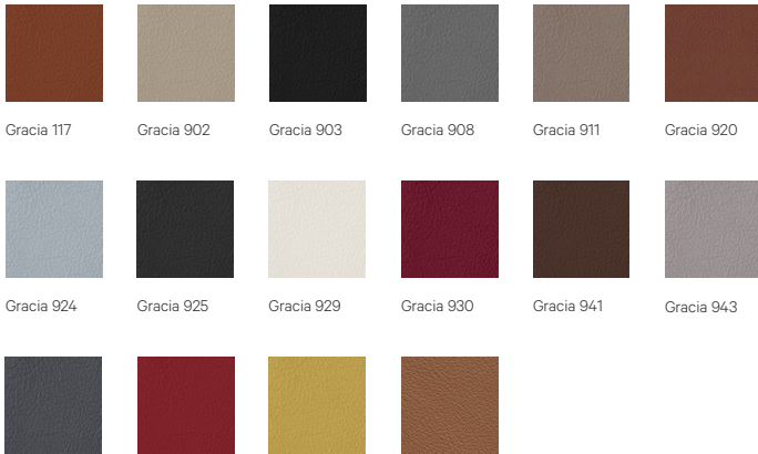
Gracia 117 | Gracia 902 | Gracia 903 | Gracia 908 | Gracia 911 | Gracia 920 | Gracia 924 | Gracia 925 | Gracia 929 | Gracia 930 | Gracia 941 | Gracia 943 | Gracia 944 | Gracia 945 | Gracia 950 | Gracia 967