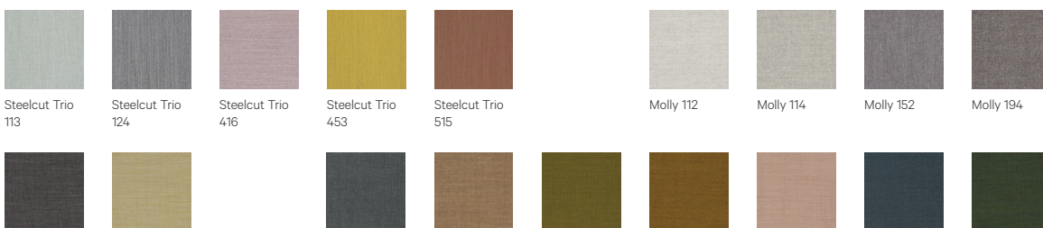
Steelcut Trio 113 | Steelcut Trio 124 | Steelcut Trio 416 | Steelcut Trio 453 | Steelcut Trio 515 | Molly 112 | Molly 114 | Molly 152 | Molly 194 | Canvas 154 | Canvas 414 | Remix 173 | Remix 252 | Remix 412 | Remix 422 | Remix 612 | Remix 873 | Remix 982

G1: Remix | G2: Molly, Canvas | G3: Steelcut Trio