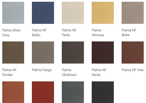
Palma Silver Grey | Palma NF Baltic | Palma NF Perle | Palma Mimosa | Palma NF Birke | Palma NF Smoke | Palma Fango | Palma Olivbraun | Palma NF Kenia | Palma NF Inka | Palma Whisky | Palma Lachs | Palma NF Antrazit | Palma NF Schwartz